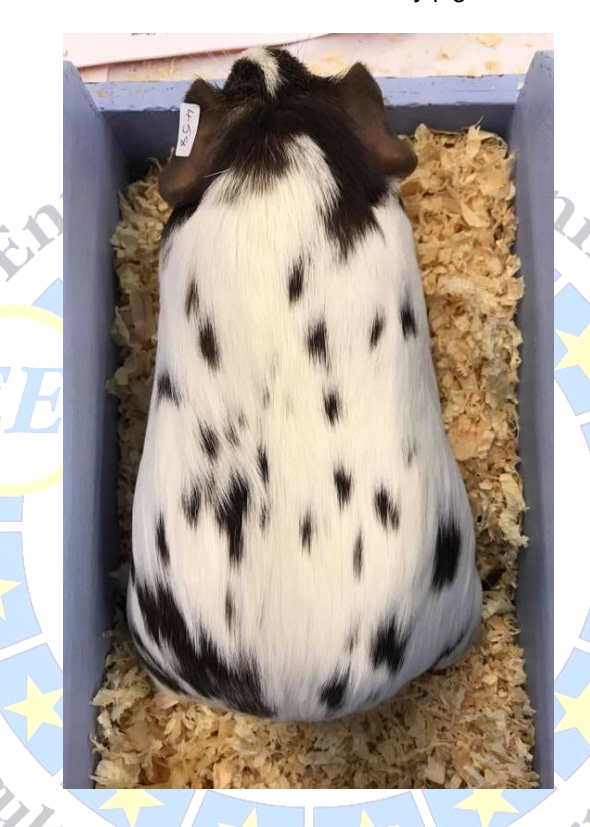
(NB – Important: Dalmations should never be bred together and Dalmations should never be bred with Roans)